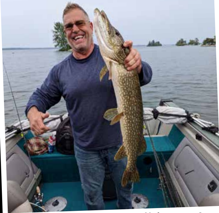
Nice Northern Pike from the St. Lawrence River in Canada