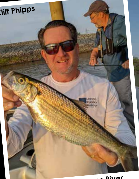
BIG SHAD from the James River