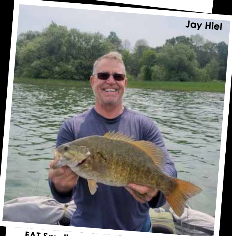
FAT Smallmouth bass from the St. Lawrence River in Canada