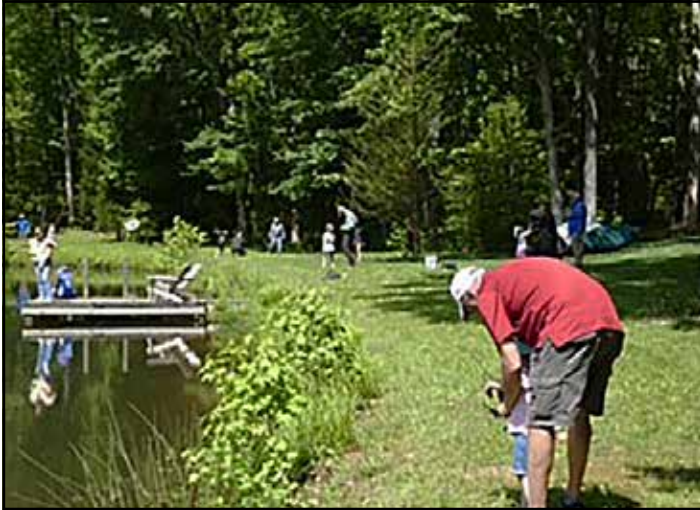
Helping hands is what its all about!