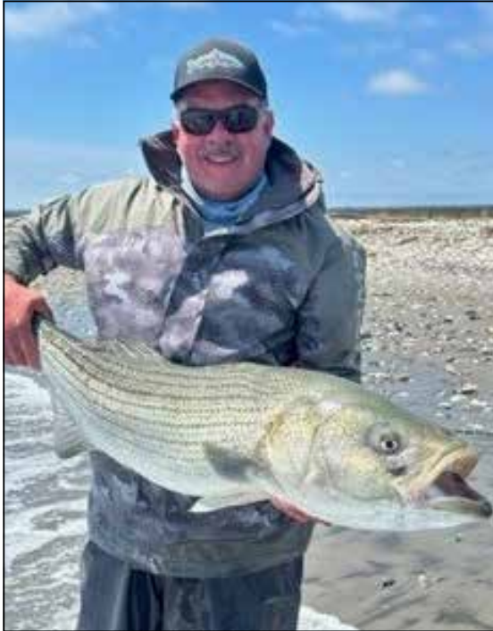
Reggie White shows off his big striper!