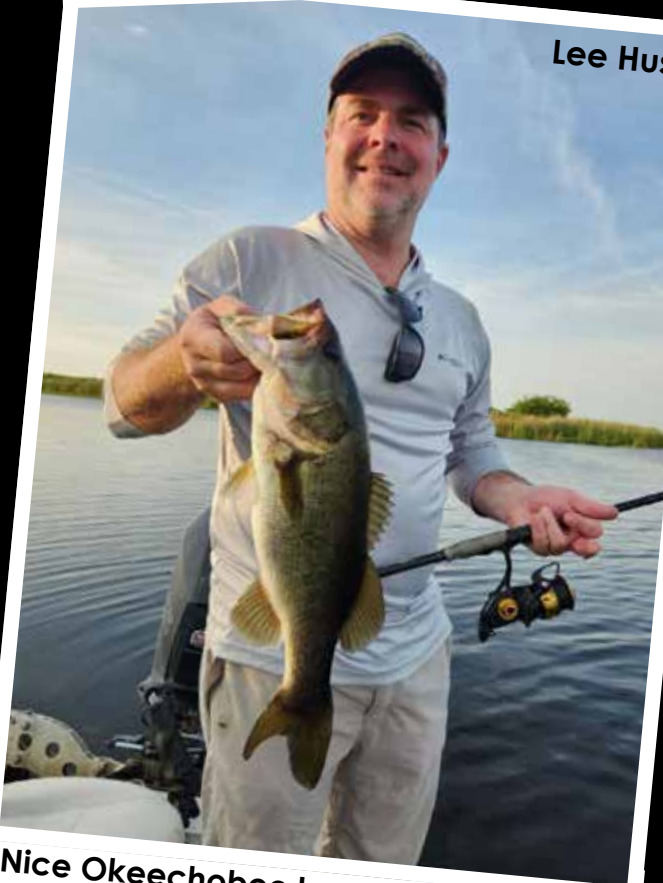
Nice Okeechobee largemouth