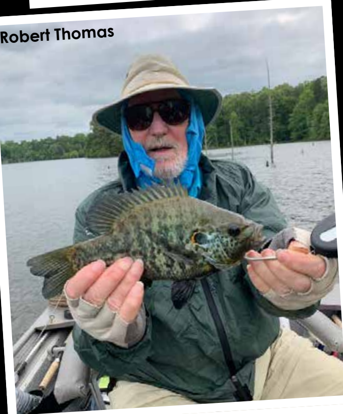
Shellcracker, Briery Lake