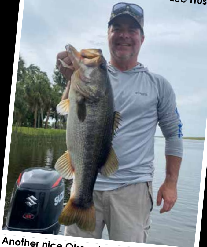
Another nice Okeechobee largemouth