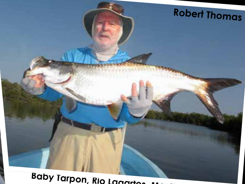
Baby Tarpon, Rio Lagartos, Mexico