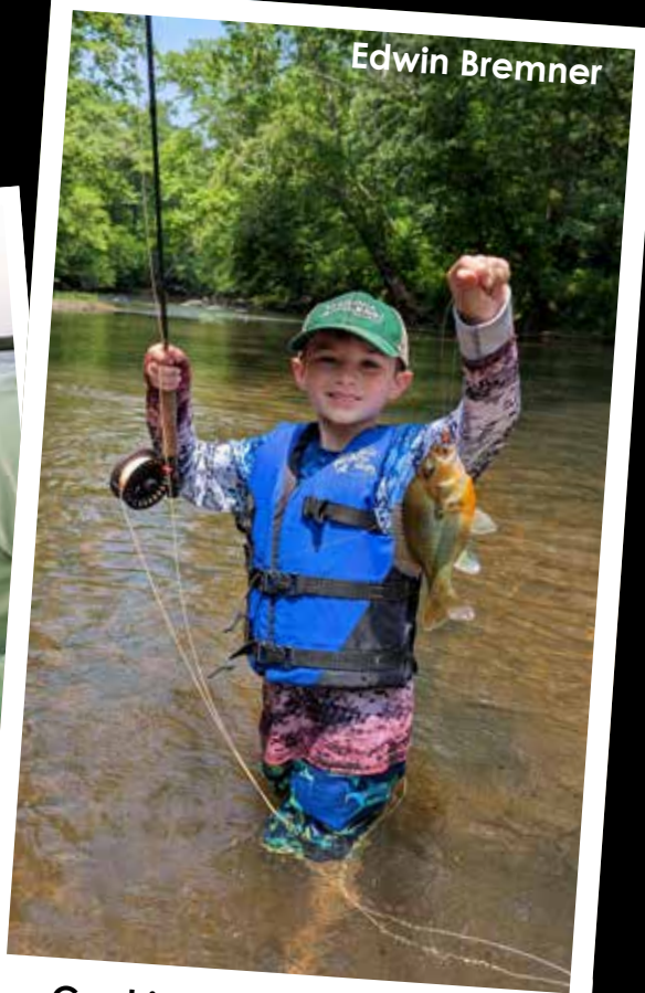
Crushing it on the South Anna river with a 4wt fly rod!