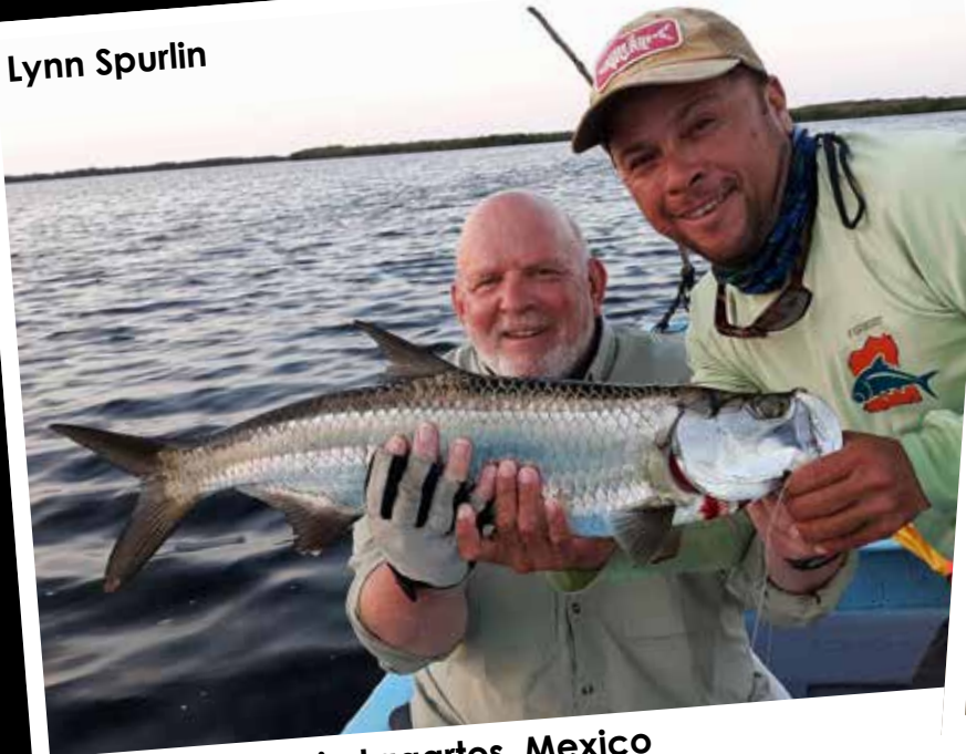
Baby Tarpon Rio Lagartos, Mexico