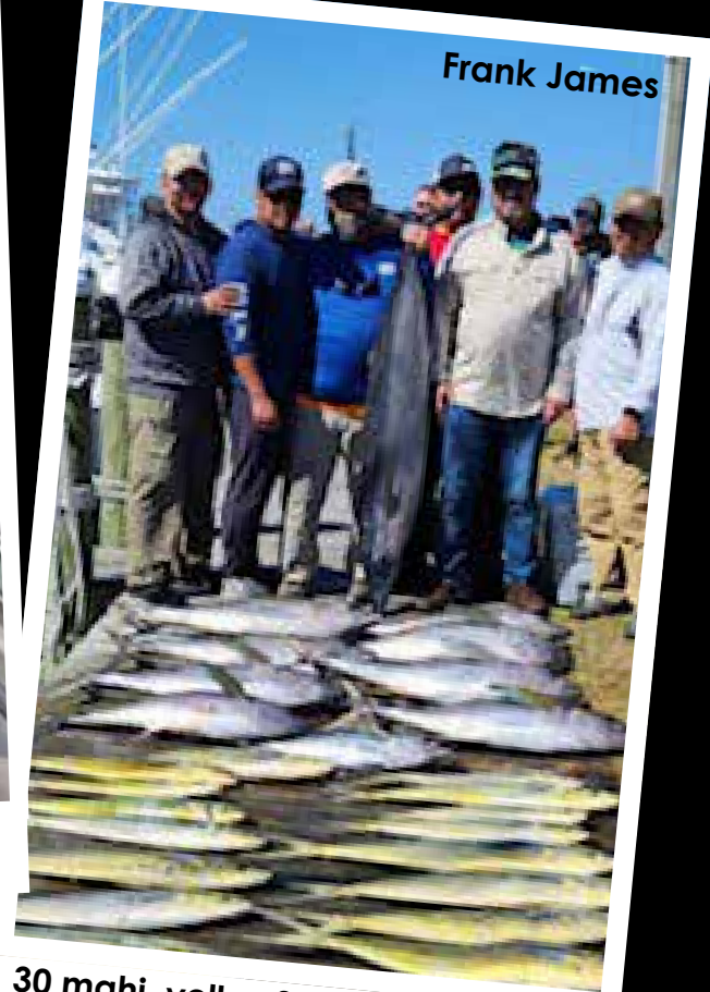
30 mahi, yellowfin and blackfin tuna, black tip shark and a 75 lb citation Wahoo caught from out of Oregon Inlet with a chartered boat called the Bi-Op-Sea.