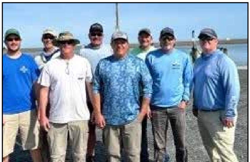
THE 2023 RED DRUM AND STRIPER SURF TEAM