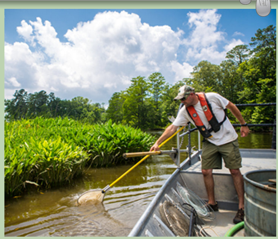
Stocking F1 largemouth bass fingerlings into the Chickahominy River.

Studies have shown F1 intergrade fish have potential to grow faster and reach larger sizes than pure Northern strain fish, Florida strain fish, or other crosses beyond the first generation (e.g., the offspring of two F1 fish would be F2 fish, and these don't show enhanced growth rates). However, that first generation cross (F1s) do tend to grow faster (and maybe get larger) than largemouth bass currently swimming around in our lakes. The idea behind stocking these fish is we want to try to enhance the trophy fishery component in our big lakes. If we can get fish to a trophy size