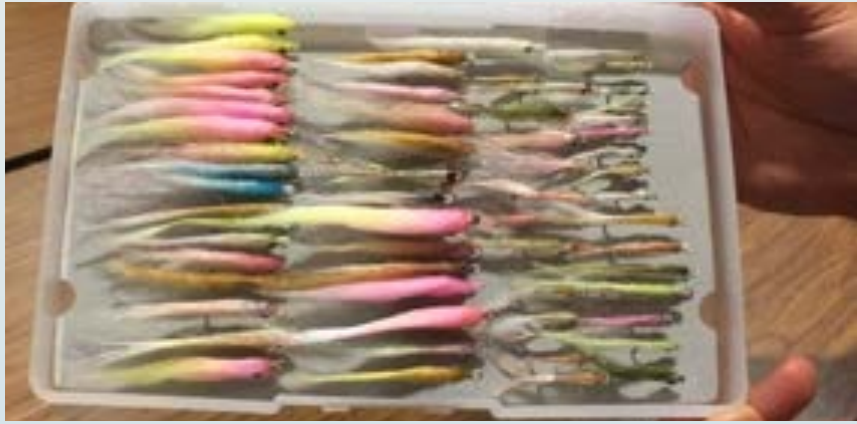
A Selection of Fly's that False Albacores Cannot Resist

Using a on-screen slide show, all you wanted to know about fly fishing for albacore (tackle, fly/lure selection, fishing grounds and how to find, feed, fight and photograph and release this bullet of the sea) was presented.