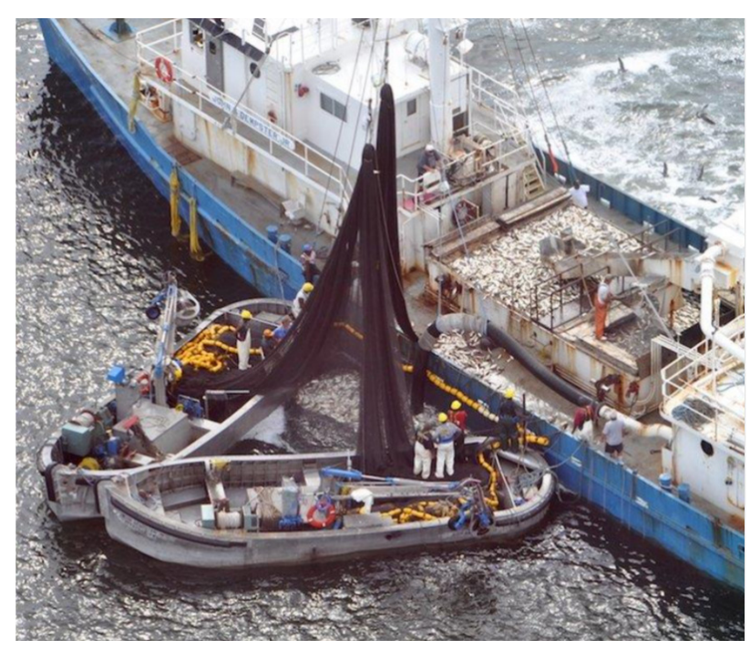
An Omega Protein menhaden factory ship at work on the Chesapeake Bay.

Virginia's massive reduction fishery is dominated by Texas-based Omega Protein operating out of a Reedville factory employing about 200 people. The company benefits from an allocation representing nearly 80 percent of the allowance for the entire east coast. Omega operates a fleet of ships, purse seine boats and spotter planes to find and capture entire schools of these ecologically important forage fish. The fish are hauled to Reedville where they are processed into additives for cosmetics, health products, animal feed and fish meal. Menhaden are critical components of the Chesapeake ecosystem as food for other keystone species such as striped bass, bluefish, dolphin, and osprey, and they filter the Bay by consuming algae from the overly nutrient-rich water. Scientists have established that controlling the removal of menhaden is necessary for