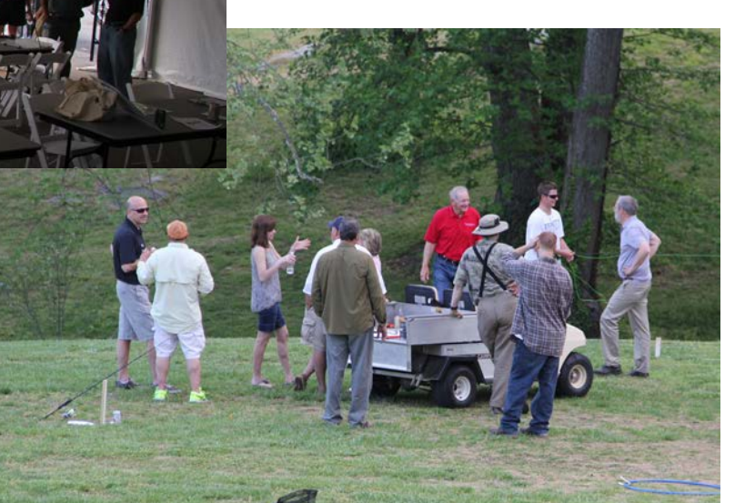
Maymont Fish Fry