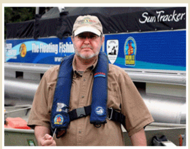
Inflatable Type Shown (1) Inflates With The Pull Of The Lanyard Or Upon Immersion

Manassas, VA – Boating safety advocates across the U.S. and Canada have teamed up to promote safe and responsible boating, including consistent life jacket wear every time boaters are on the water, during National Safe Boating Week, held from May 21-27, 2016.