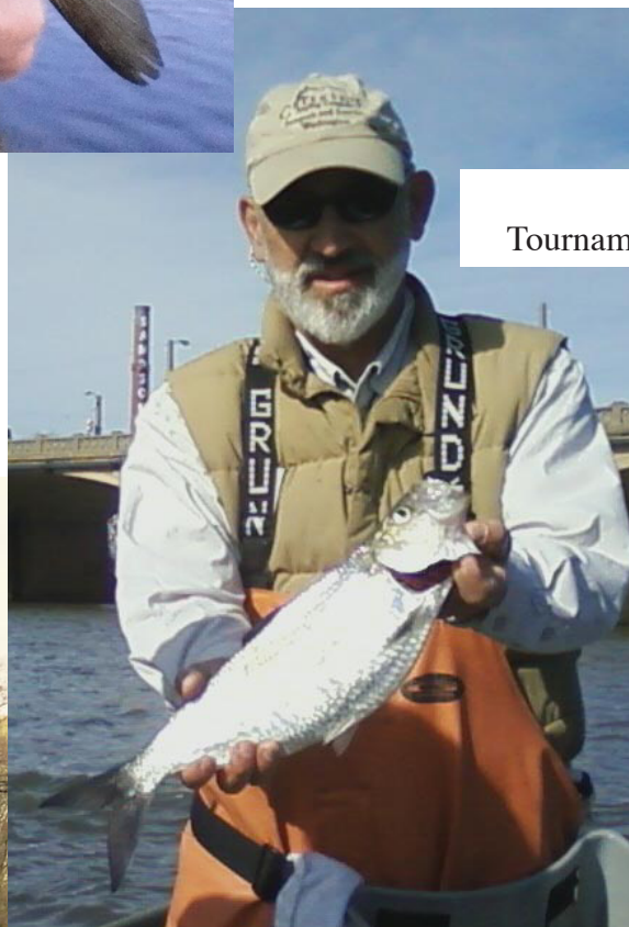
Stuart Lee Tournament 2-4 hickory shad