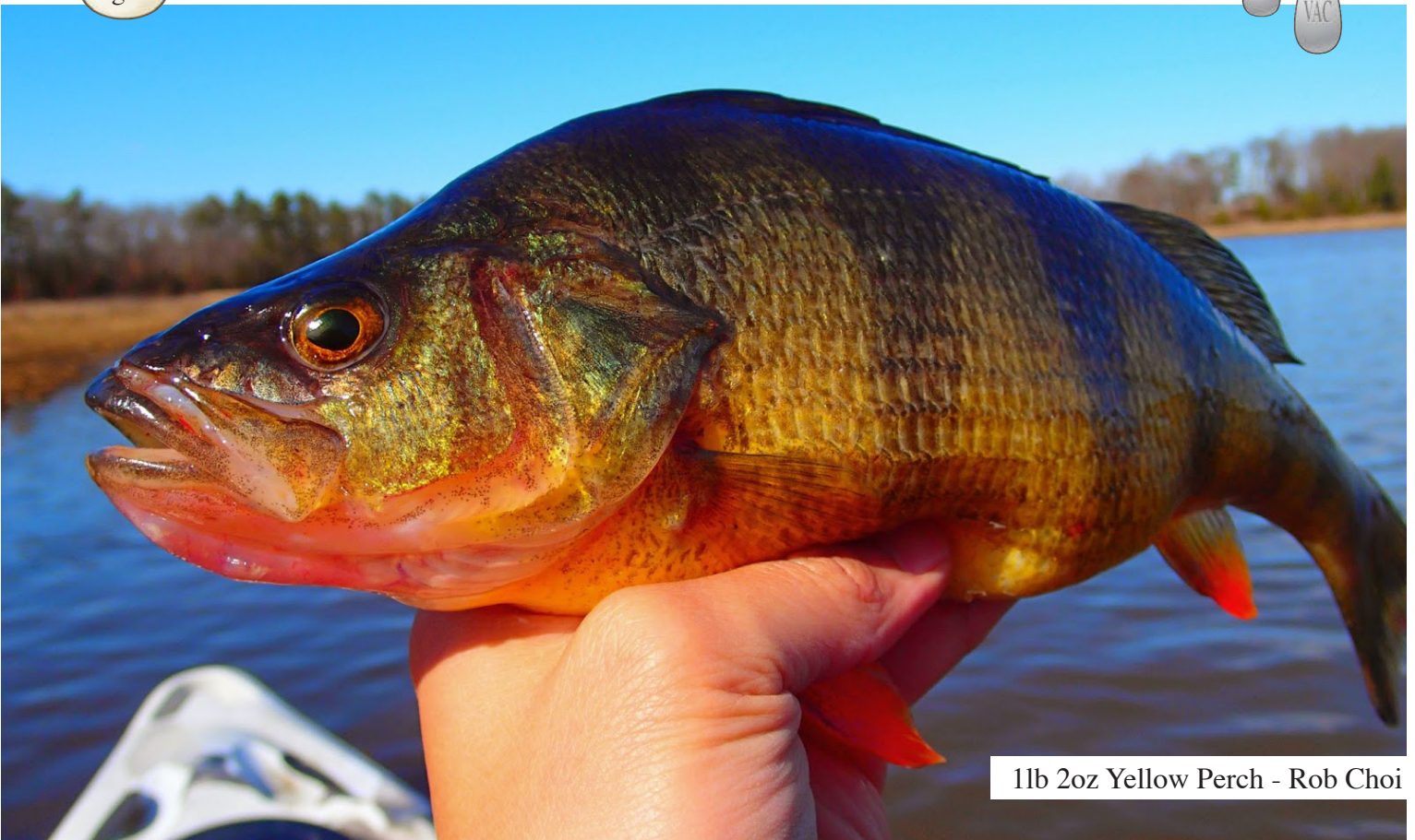
11lb 2oz Yellow Perch - Rob Choi