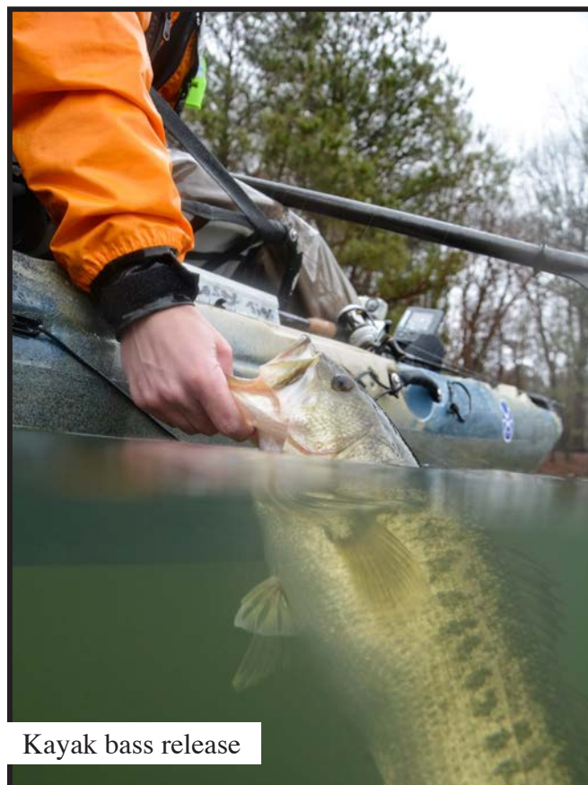
Kayak bass release