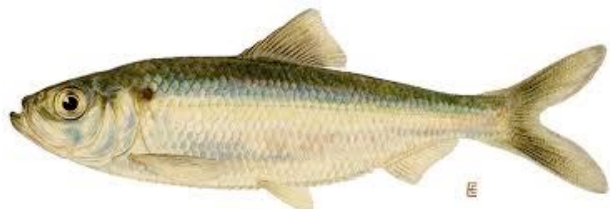
Alewife Alewife Aliases

(Also: Anadromous alewives; Bigeye herring; Branch herring; Clipped roefish; Corned alewives; Freshwater herring; Gray herring; Grayback; Greyback; Kyak; River herring; Sawbelly; White herring; kyack)