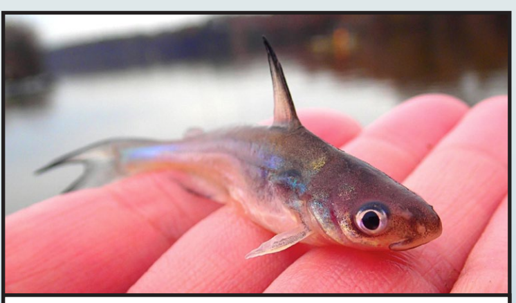
Baby catfish aka castnetter's lament