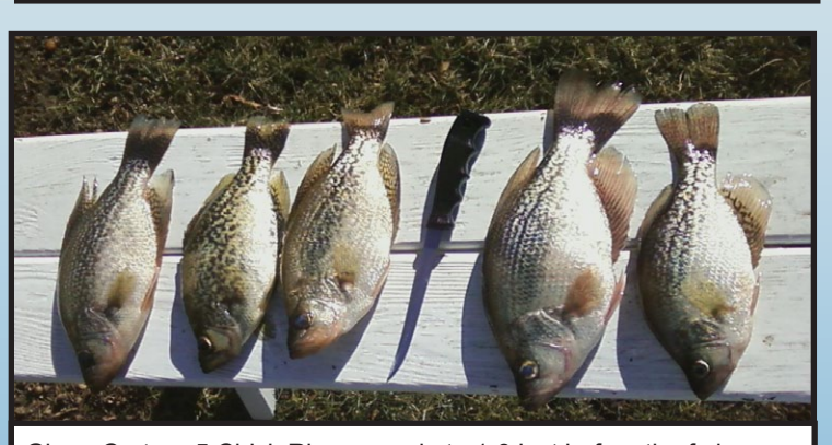
Glenn Carter - 5 Chick River crappie to 1-8 just before the frying pan