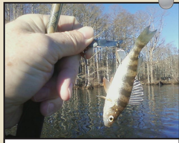
Glenn Carter with a trophy ring perch caught on a 1lb homemade silver buddy