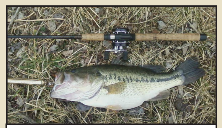
Glenn Carter - 6lb class Largemouth - You may think they're the same fish but no two lateral lines are the same