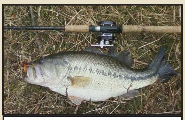
Glenn Carter - 6lb class Largemouth