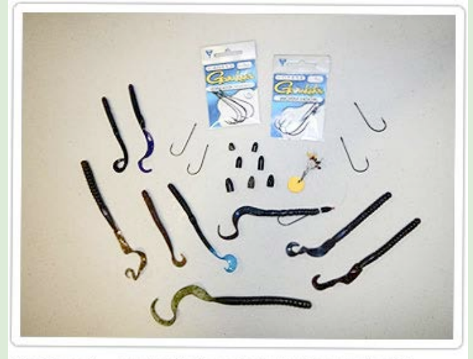
The Texas rig worm is a timeless classic that bass can't resist.

The Texas rig worm is simply a bullet sinker, hook and a plastic worm. To rig it begin by threading the bullet sinker on the line, tie on the hook and then thread the hook about 3/8" into the head of the worm and exit. Then rotate the hook until the point is facing the worm and continue to thread