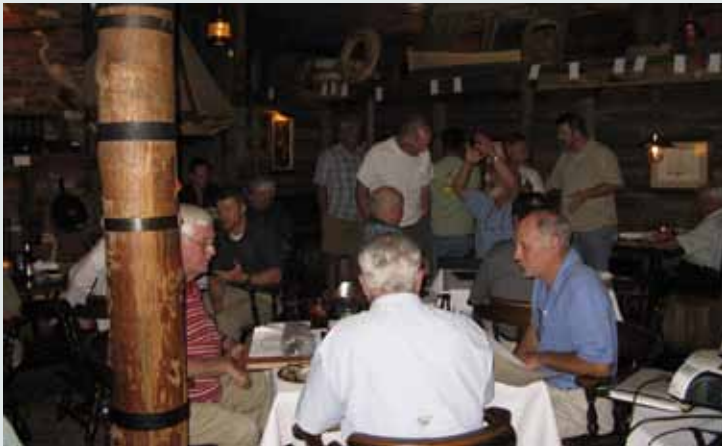
Last Membership Meeting at the Skilligalee on 6/25/13