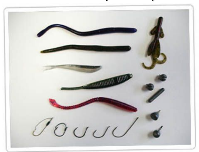
Drop Shot lures, weights, and hooks.

Many hooks and weights have been created specifically for drop shotting with 2 basic hook options. First, a small #6 - #1 hook