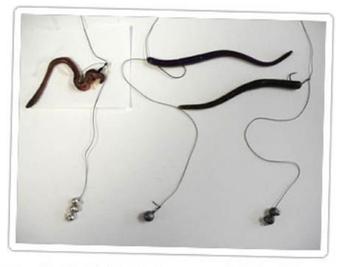
Drop Shot Rigs showing plastic worm nose hooked and Texas rigged and a night crawler on a weedless hook.

designed to nose hook a plastic bait. Simply thread the hook into the head of the worm about a •'bc" before bringing the hook out. With very little of the hook in the bait it allows the worm to wiggle and undulate wildly. Secondly, if you are fishing around cover and snags, use a light wire #1-1/0 work hook and Texas rig the plastic bait. There have also been weights designed with clips especially for drop shotting, 3/16 and •'bc oz, are the most popular sizes. Split shot can also be crimped on the line – just tie an overhand knot at the end of the line to prevent them from sliding off.