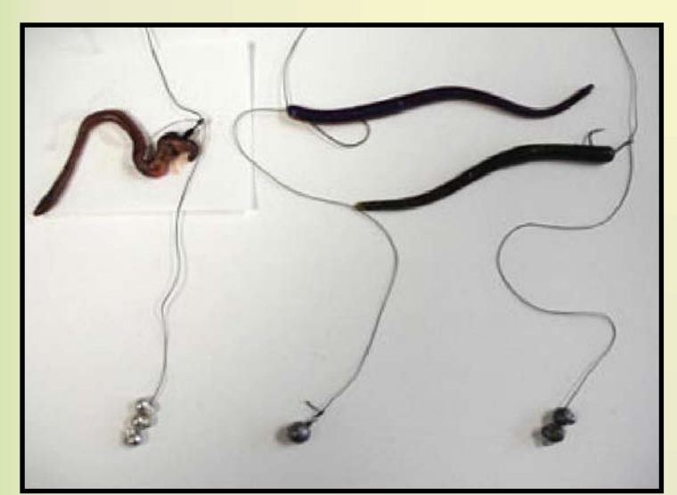
Drop Shot Rigs showing plastic worm nose hooked and Texas rigged and a night crawler on a weedless hook.

Many hooks and weights have been created specifically for drop shotting with 2 basic hook options. First, a small #6 - #1 hook designed to nose hook a plastic bait. Simply thread the hook into the head of the worm about a •'bc" before bringing the hook out. With very little of the hook in the bait it allows the worm to wiggle and undulate wildly. Secondly, if you are fishing around cover and snags, use a light wire #1-1/0 work hook and Texas rig the plastic bait. There have also been weights designed with clips especially for drop shotting, 3/16 and •'bc oz, are the most popular sizes. Split shot can also be crimped on the line – just tie an overhand knot at the end of the line to prevent them from sliding off.