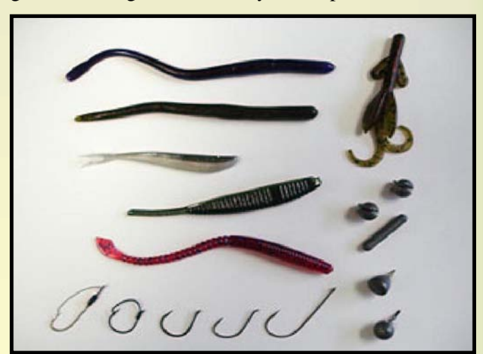
Drop Shot lures, weights, and hooks.

The big advantage to this technique is that the weight rests on the bottom and the worm is suspended above which gives it a lot of action since the weight is not directly attached to the lure. Simply allow the rig to go to the bottom and shake the worm on a semi-slack line, drag the rig and repeat, maintaining bottom contact throughout the retrieve.