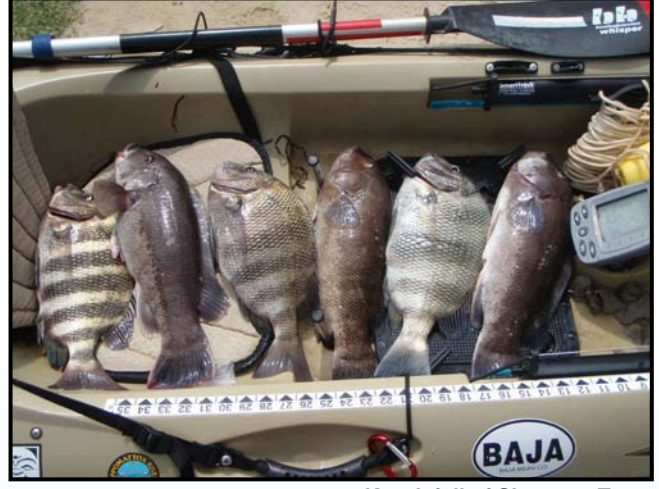
Kayak full of Sheeps n Togs