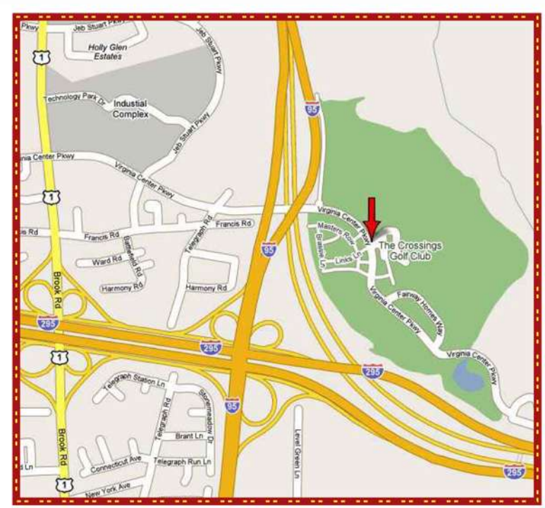
Map from maps.google.com

Take I-95 North to Exit 84 B. Exit ramp will merge on to I-295 North. Remain in right lane. Take Exit 43C to Ashland and US 1. Exit ramp will merge onto US 1 North (Brook Road). Follow US 1 to first stop light at Virginia Center Parkway, turn right. Follow Virginia Center Parkway for 9/10 of a mile and turn left into the Resort entrance.