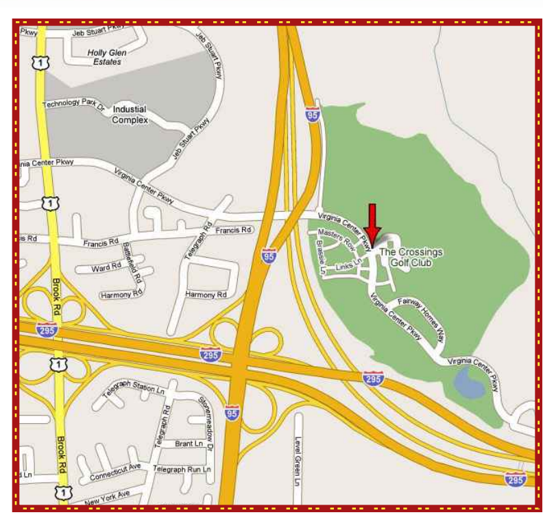
Map from maps.google.com

Take I-95 North to Exit 84 B. Exit ramp will merge on to I-295 North. Remain in right lane. Take Exit 43C to Ashland and US 1. Exit ramp will merge onto US 1 North (Brook Road). Follow US 1 to first stop light at Virginia Center Parkway, turn right. Follow Virginia Center Parkway for 9/10 of a mile and turn left into the Resort entrance.