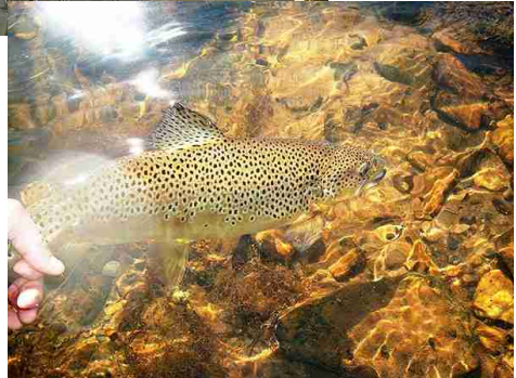
Brown Trout being released