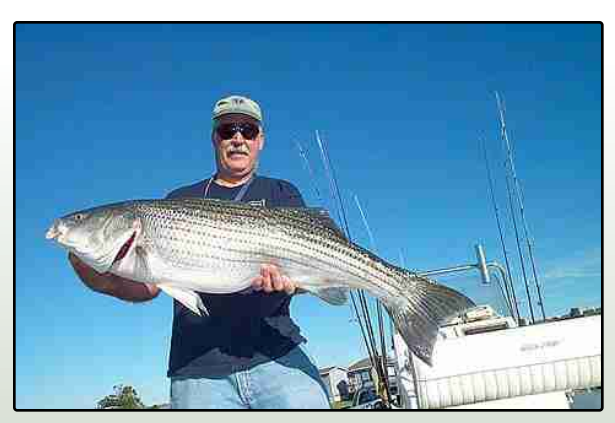
Parks with a nice 25-5 striped bass

To save postage and additional efforts of VAC officers, please forward a copy of the below form along with your dues payment to: